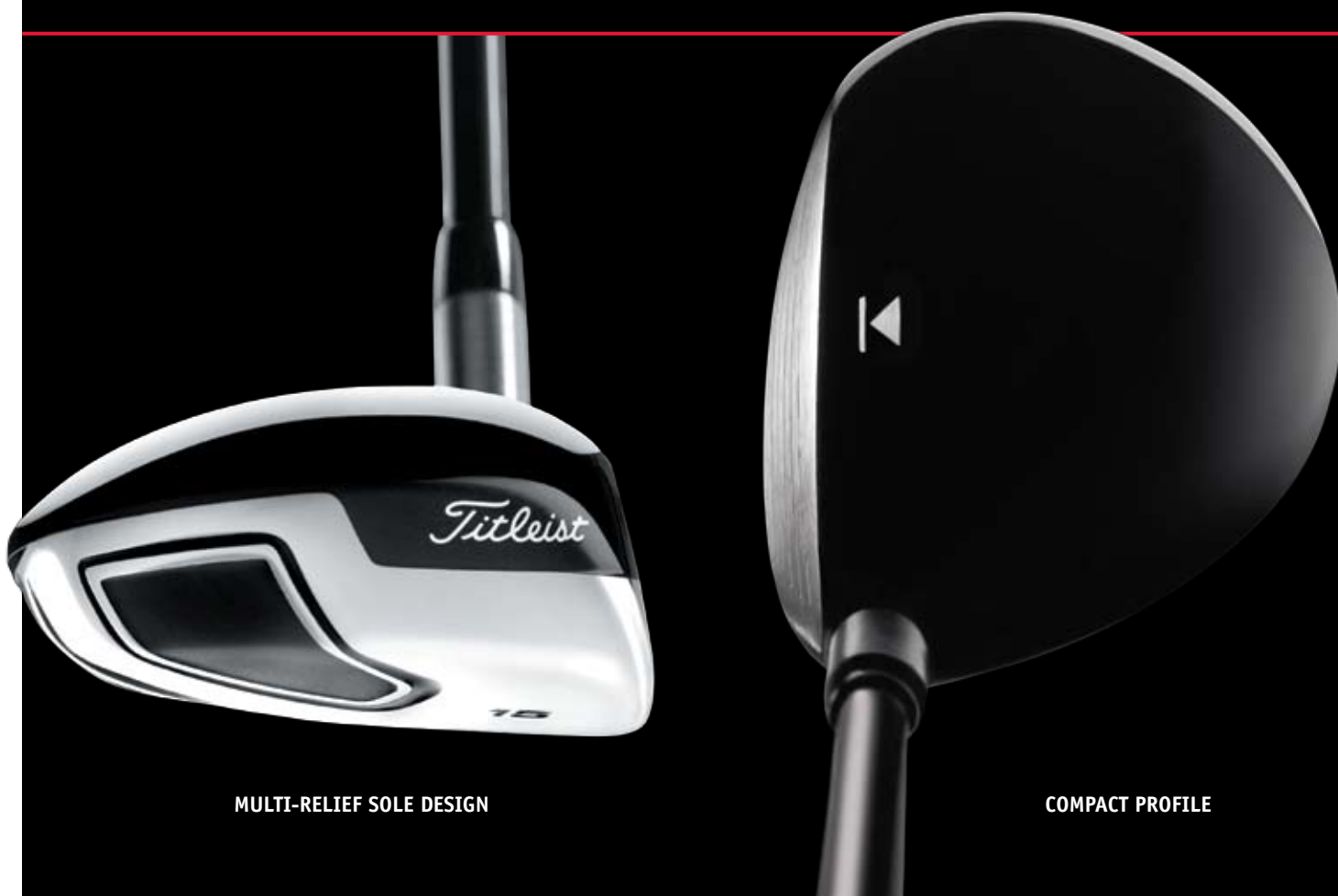
MULTI-RELIEF SOLE DESIGN