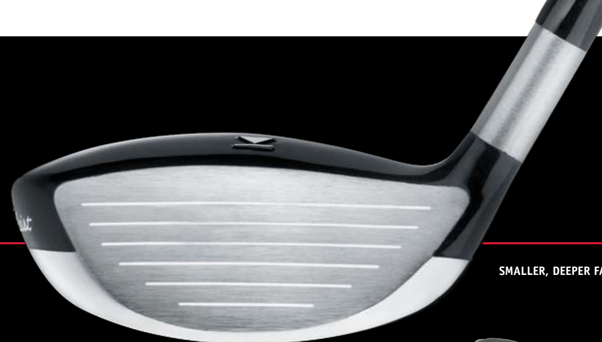
SMALLER, DEEPER FACE

A specially designed, one piece, carbon-fiber rib system keeps the shaft more concentric during the swing preventing ovaling for maximum energy transfer and added stability. Produces low-to-mid launch and low spin.